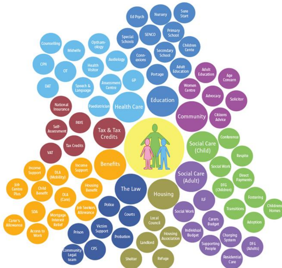
Figure 2.1: Service complexity (Duffy & Hyde, 2014)

In mapping the type and location of specialist support available for women who experience multiple disadvantage in England and Wales (Holly, 2017), researchers came up against many of the barriers that women face when trying to identify services that may be able to assist them. This included not knowing the right questions to ask to get the answers they need; being over-reliant on the knowledge of the person they ask; not knowing whether they meet the referral criteria; and not knowing how good the service is or whether it still exists. All these barriers are amplified for women at a time of crisis. Overall, the mapping of services currently available to women highlights how the system further disadvantages women by trapping them within a maze – a confusing jumble of paths that often lead nowhere or that give multiple and competing solutions to different points – rather than supporting them to move along and out of the labyrinth of difficulties that characterise their lives. Sharpen's (2018) study revealed a feeling among women with multiple needs that services can often re-traumatise women by the lack of joined-up approaches, causing them to constantly re-tell their stories to multiple practitioners.